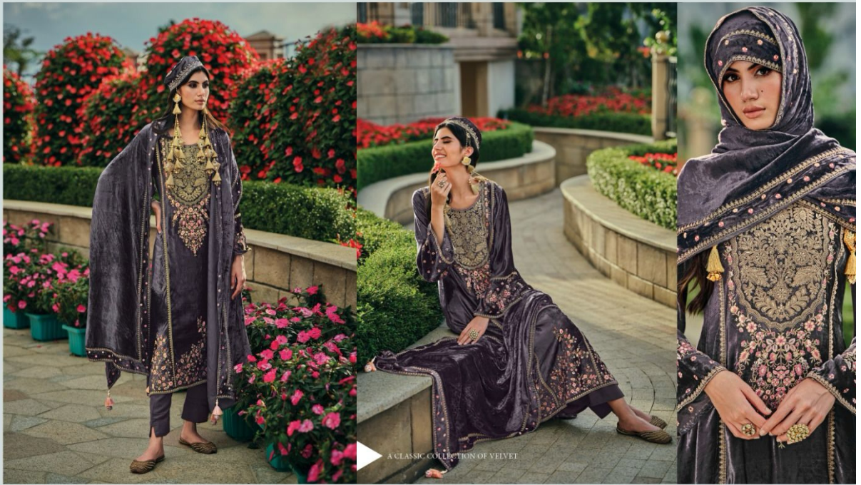
A CLASSIC COLLECTION OF VELVET