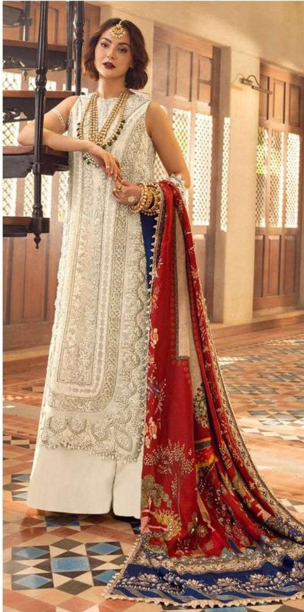
C - 1610