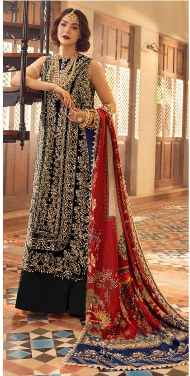
C - 1610 B