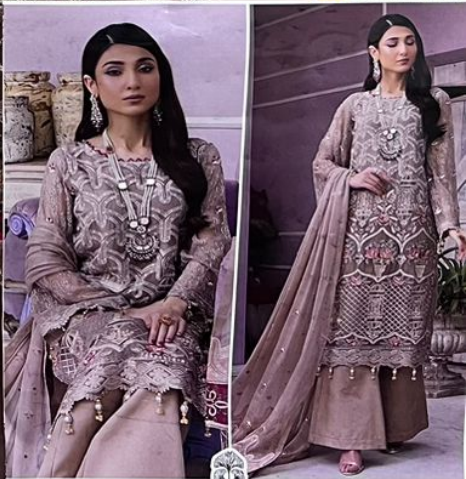
AAEESHA VOL-3 ZAHA D.No.10155 TOP Fox Georgette with Embroidery BOTTOM-INNER Dull santoon DUPATTA Nazam with Embroidery