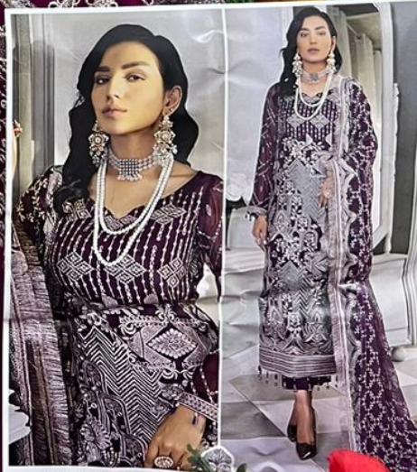
AAEESHA VOL-3 TOP Fox Couture Embroidery BOTTOM LINER