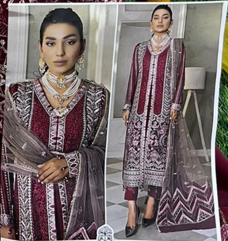
A. EESHA VOL. 3 ZAHA D.No.10157 TOP Georgette with embroidery BOTTOM-INNER Dull saree Butterfly net