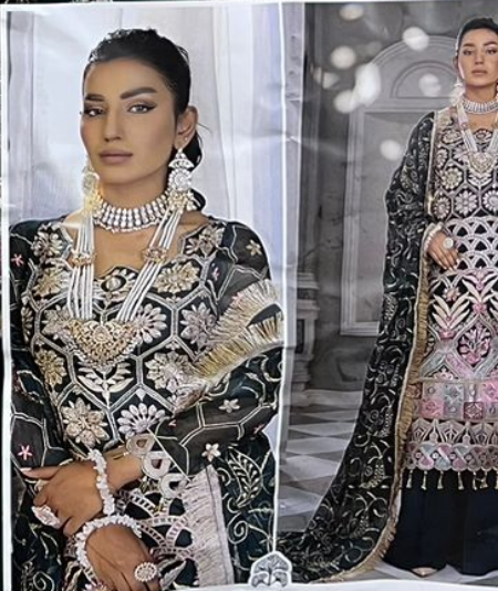
AAEESHA VOL-3 ZAHA D.No.10156 TOP Fox Georgette with Embroidery BOTTOM-INNER Dull santoon DUPATTA Nazm with Embroidery