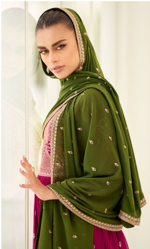
A | - 9659