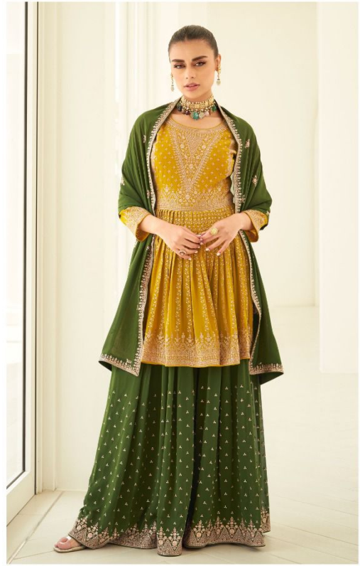
A | - 9661