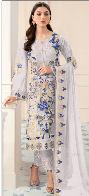
S - 116 G