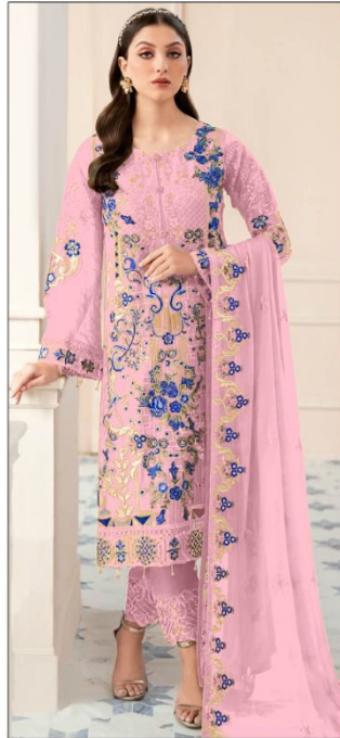
S - 116 F