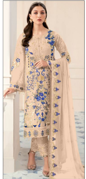
S - 116 H