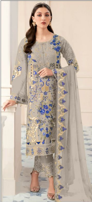
S - 116 E