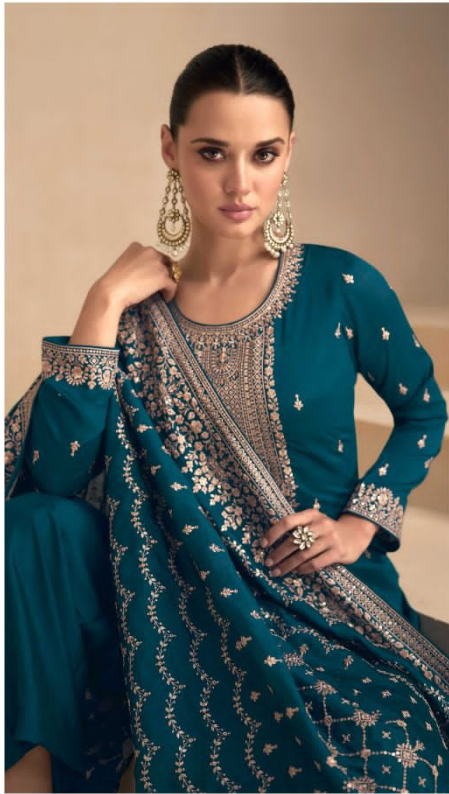
A - 9571