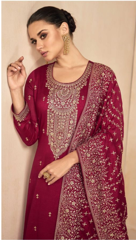
A - 9574