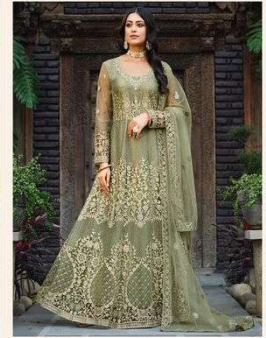
► 2097 ◀