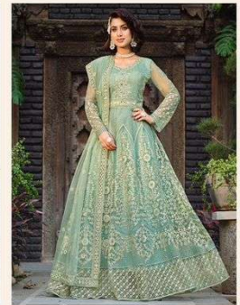
► 2099 ◀