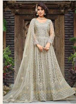
► 2096 ◀