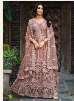
► 2098 ◀