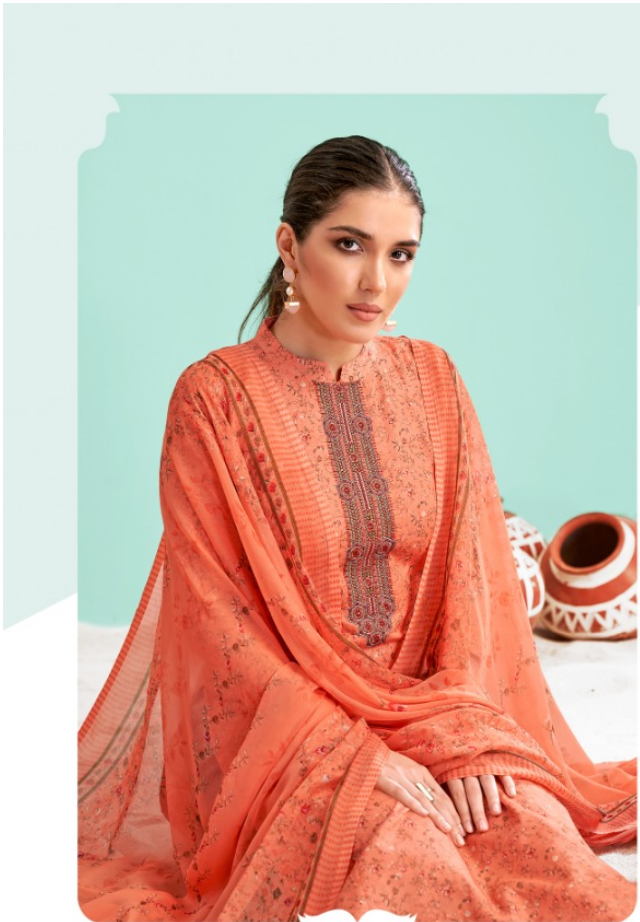
When you are clear what you have to wear, then confidence is the key of your beautiful look. ☀ S 805-001 ☀