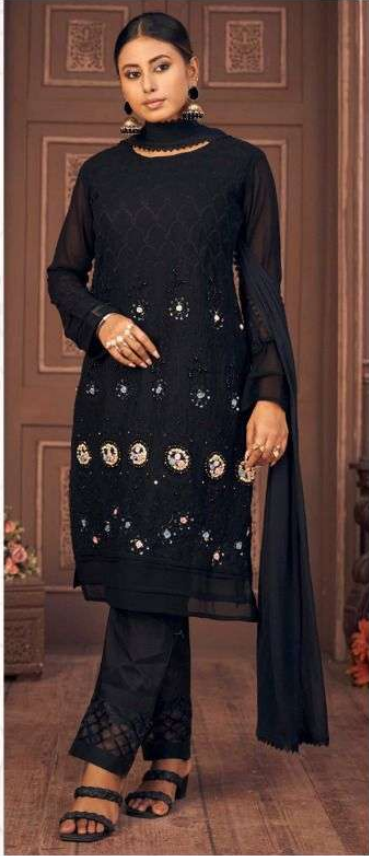
C - 1512 A