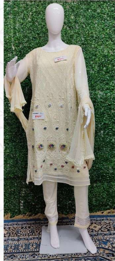
C - 1512 C