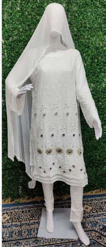
C - 1512 B