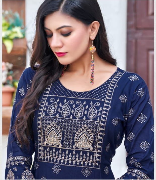
Traditional looks rule the season with a hint of modern-chic!