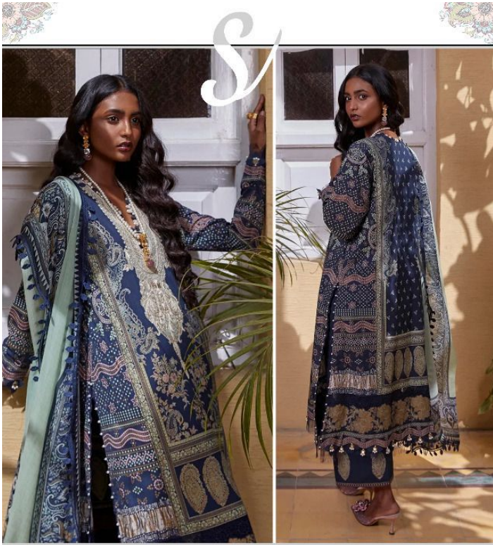
SANA SAFINAZ NX MUZLIN COLLECTION VOL-9