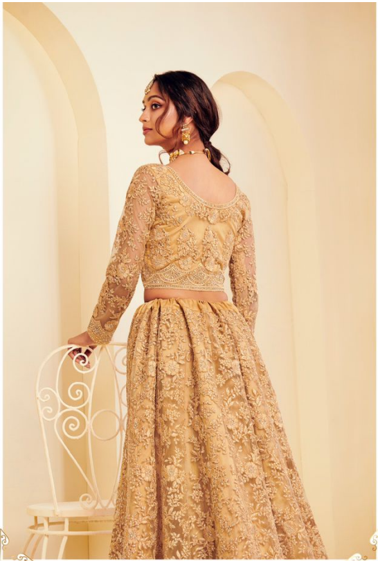
Lace fabric, bird pattern & sumptuous detailing adorn modern silhouettes