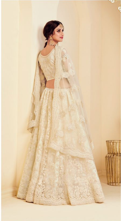
A blend of colors that highlight every corner of the attractive designs that in turn adorn you with vast beauty