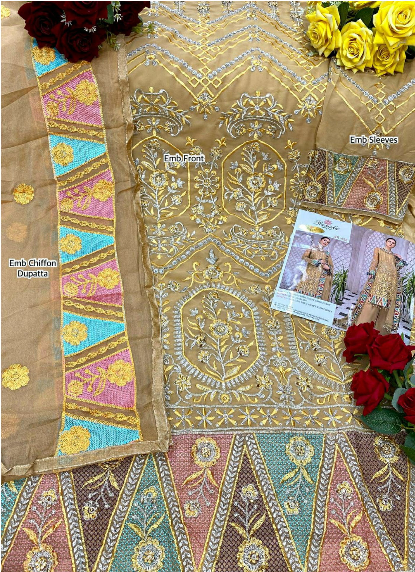
Emb Chiffon Dupatta