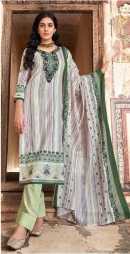
| 10004 |