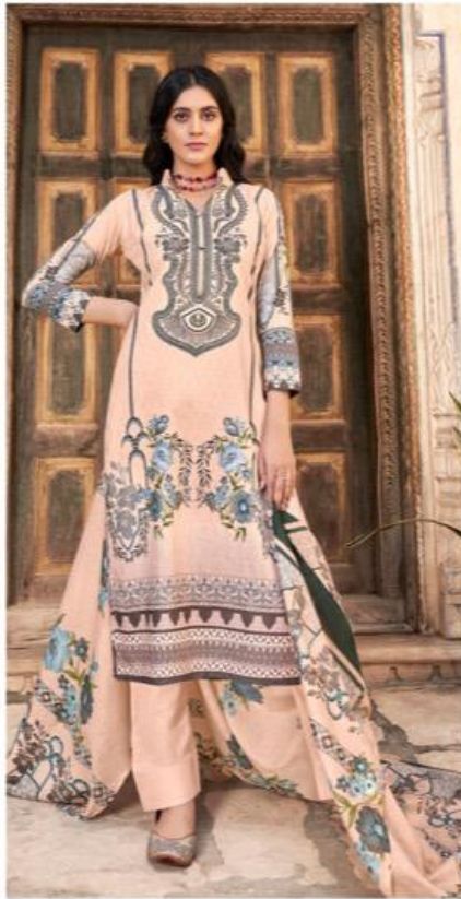
| 10010 |