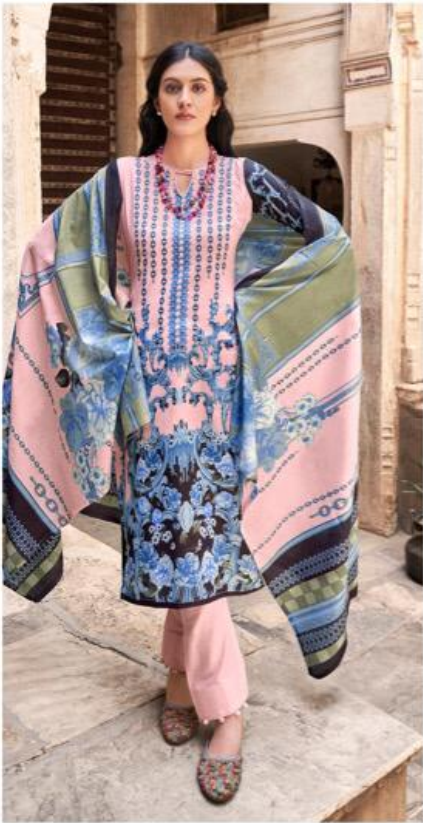
| 10009 |