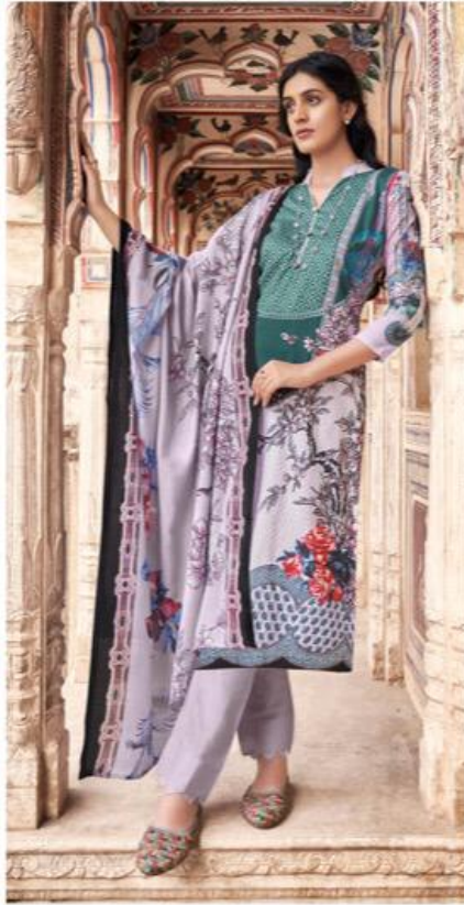
| 10005 |