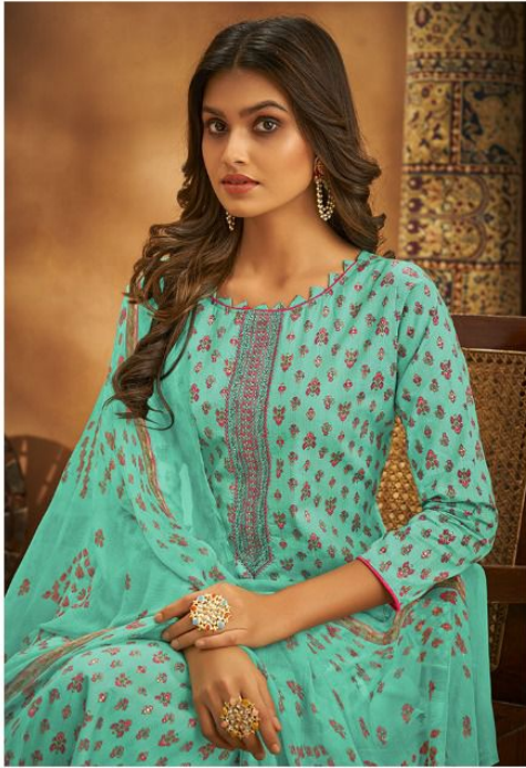
this season celebrate the magnificent in you. PALAK-712