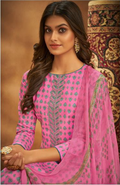
Let the most iconic you flaunt your own tale of style, grace, and magic. PALAK-711