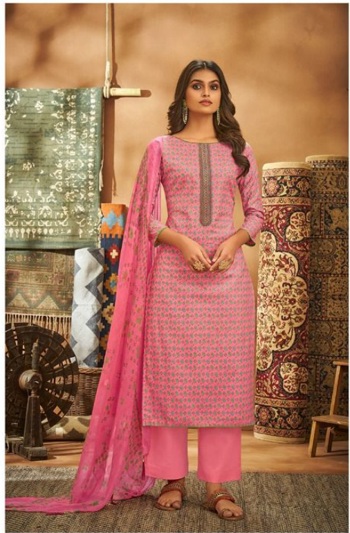
update your look with bright colors PALAK-714