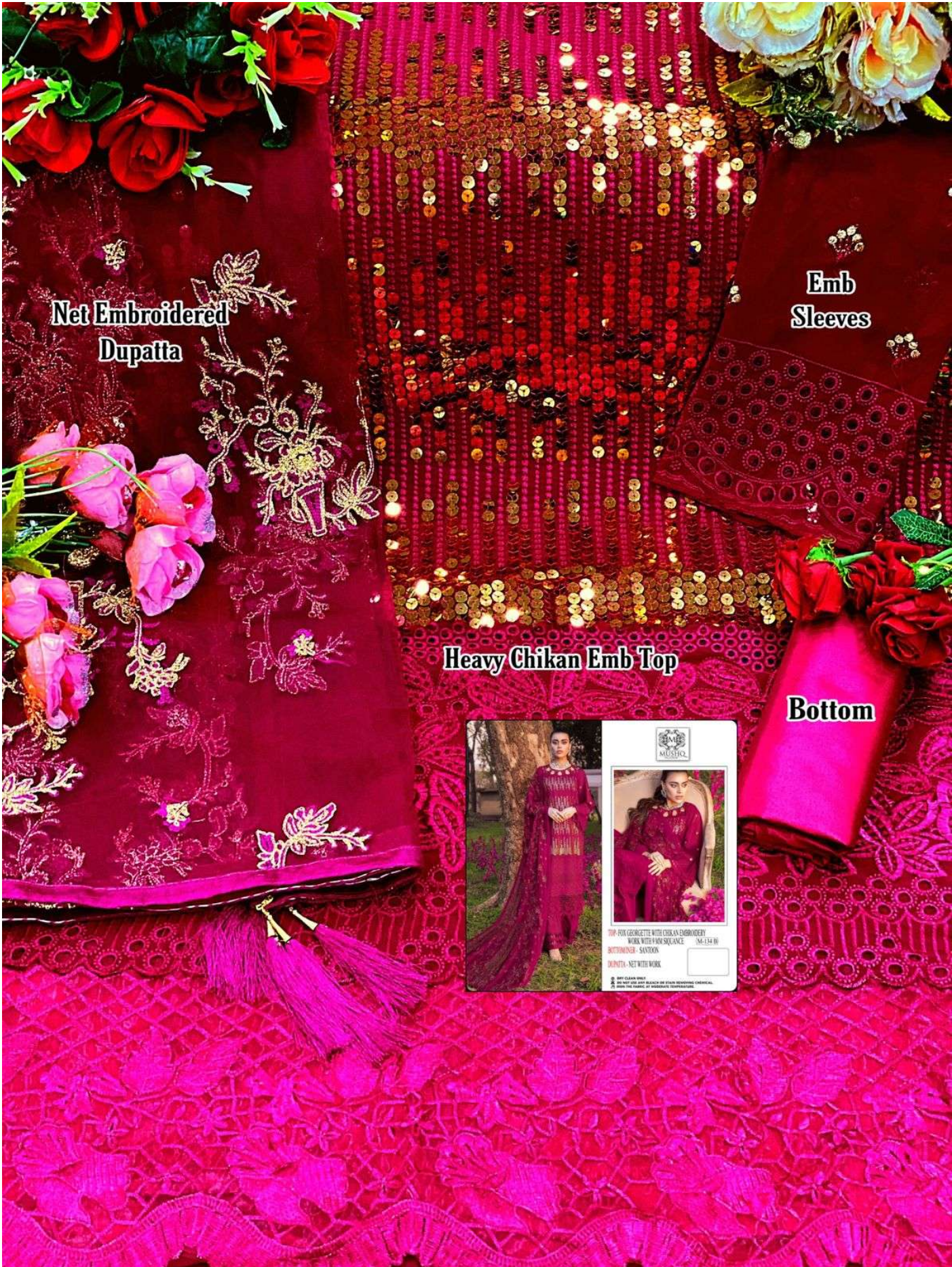
Net Embroidered Dupatta