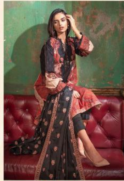
Design * 404