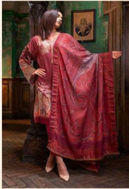
Design * 403