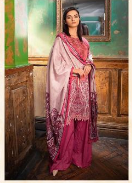
Design * 406