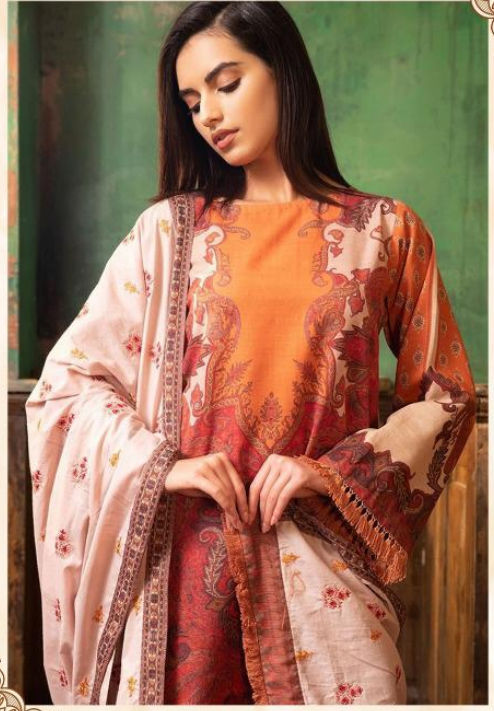
..... One is never over-dressed or under-dressed with a yellow Dress