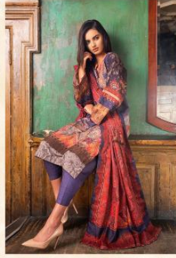
Design * 402