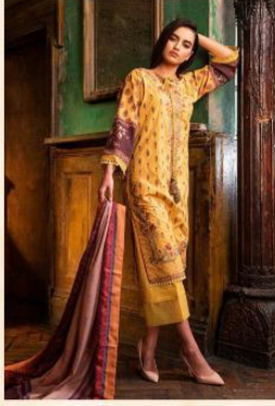
Design * 401