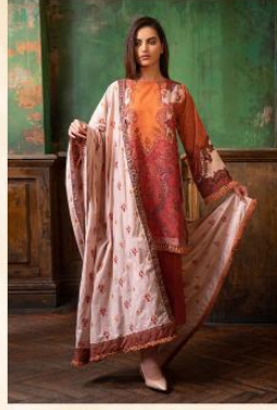
Design * 405