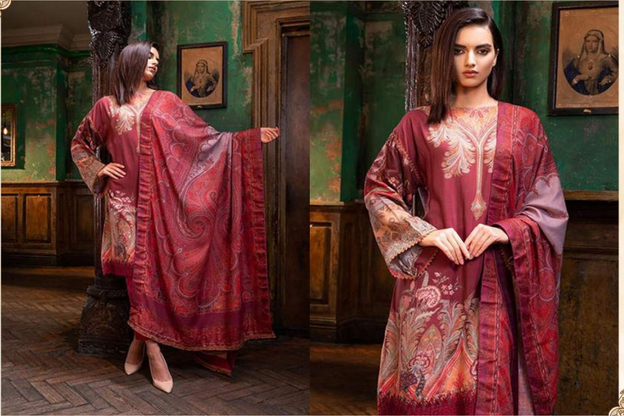
We must never confuse elegance with snobbery Design * 403 .....