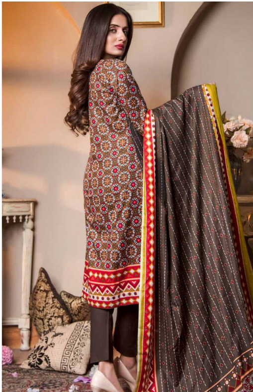
NOW LOOK FANCY AND GLAMOROUS EVEN WHEN THE SUN IS UNFORGIVING. EASY, WEARABLE AND CASUAL OPTIONS IN VOGUE THAT YOU CAN INTERACT WITH ON DAILY BASIS