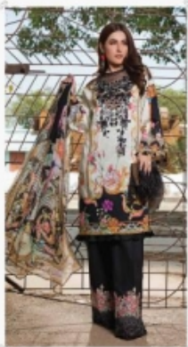
DESIGN NUMBER 093