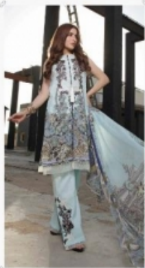
DESIGN NUMBER 092