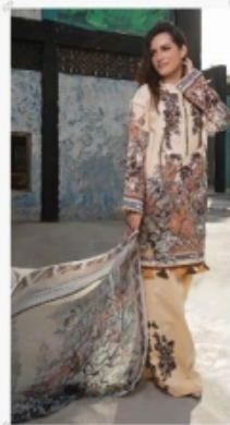
DESIGN NUMBER 094