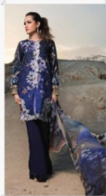
DESIGN NUMBER 091