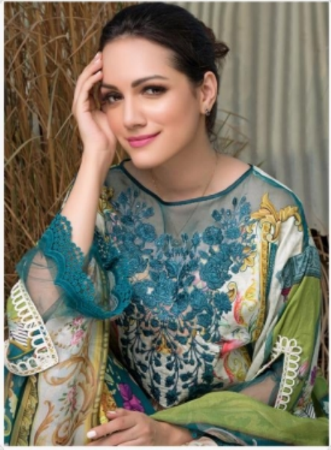
DESIGN NUMBER-898 • DUFFY SOLID •