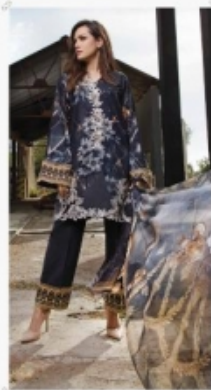
DESIGN NUMBER 095