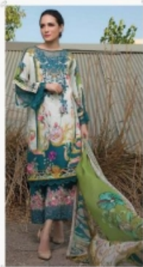
DESIGN NUMBER 096